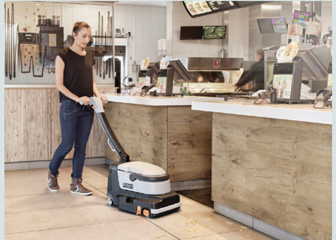
Raise the front squeegee to quickly and conveniently pick up smaller debris while scrubbing.

The SC250 uses a powerful 36 V Lithium battery that provides up to 40 minutes of run time and operates at only 66 dB A, allowing for daytime cleaning and cleaning of noise-sensitive areas. The cordless design ensures a safer cleaning environment and flexible cleaning options.