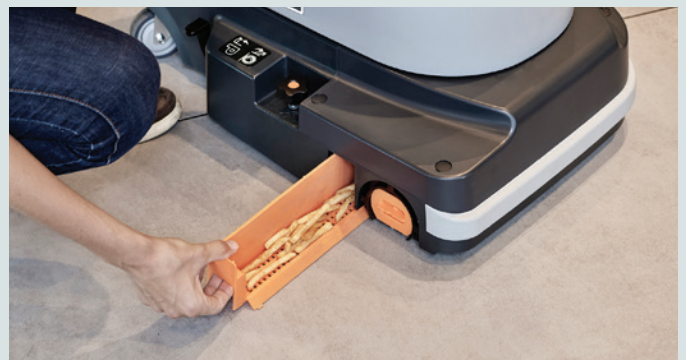
Easily access the debris tray to empty and clean.